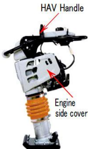
Moving image of MTX Rammer

*Latest Adobe Flash Player are required for playing above the movie. If you don't have it, please download and install from the links below.